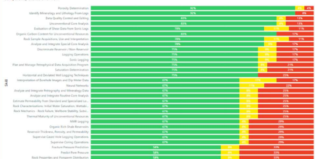
Competency Status Overview